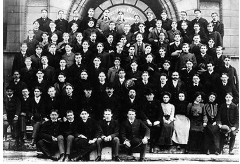
The Pharmacy School Class of 1900

enrollment had dwindled to fifty-nine. The trustees decided that the university could no longer maintain the school. An arrangement was made to transfer the students and goodwill of the School of Pharmacy of Northwestern University to the School of Pharmacy of the University of Illinois. Since the school of pharmacy conducted in Chicago by the University of Illinois was offering an equivalent program, it was decided that "the two schools could be combined without loss of efficiency and without increased cost to either." This was done in June 1917 .